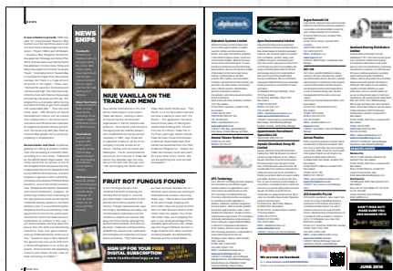
Digital edition x11